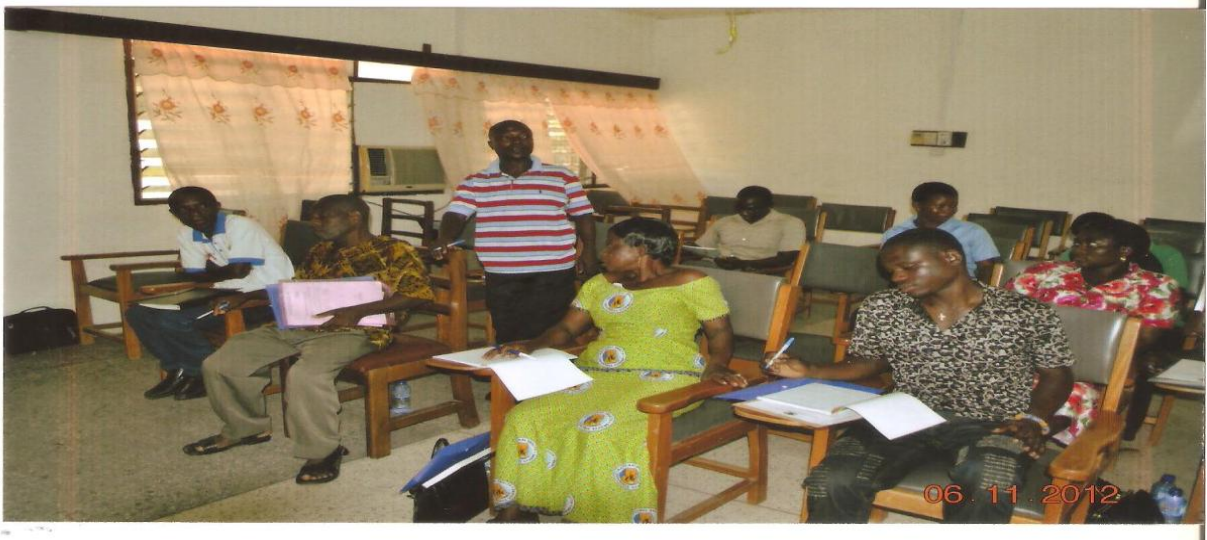
Figure 3: A cross-section of participants taking notes during the training