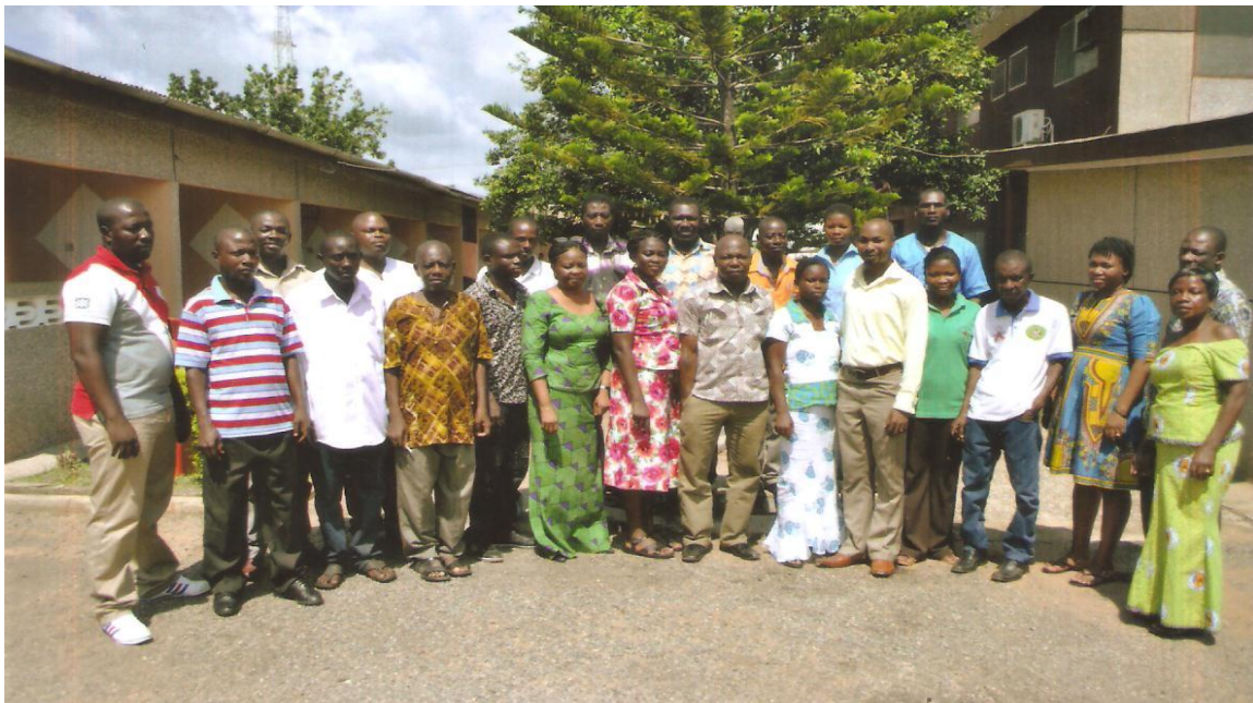
Figure 1: Group Picture of Staff of FSDA-Ghana with the Sub-Recipient NGOs

The project covered six districts in the Northern Volta Region. These districts were Nkwanta South, Nkwanta North, Krachie East, Jasikan, Kadjebi and Hohoe Municipality. During the implementation of the previous MSHAP project, it was observed that in spite of the training given to the officers of the sub-recipients, they lacked the capacity to undertake HIV programs at the local level. Most CBOs/NGOs did not have adequate skills to analyse documents and communicate relevant data for effective advocacy, communication and social mobilisation at the grass root level. Furthermore, there were gaps in the financial management system. It was in the light of the above that the Foundation for Sustainable Development in Africa (FSDA-Ghana) organised a workshop on data collection tools, financial accounting systems, stock management, monitoring and evaluation in HIV and AIDS and other sexually transmitted infections programs at Hotel De Mork, Hohoe, Volta region from 5 th to 9 th November 2012 for staff of CBOs/NGOs.